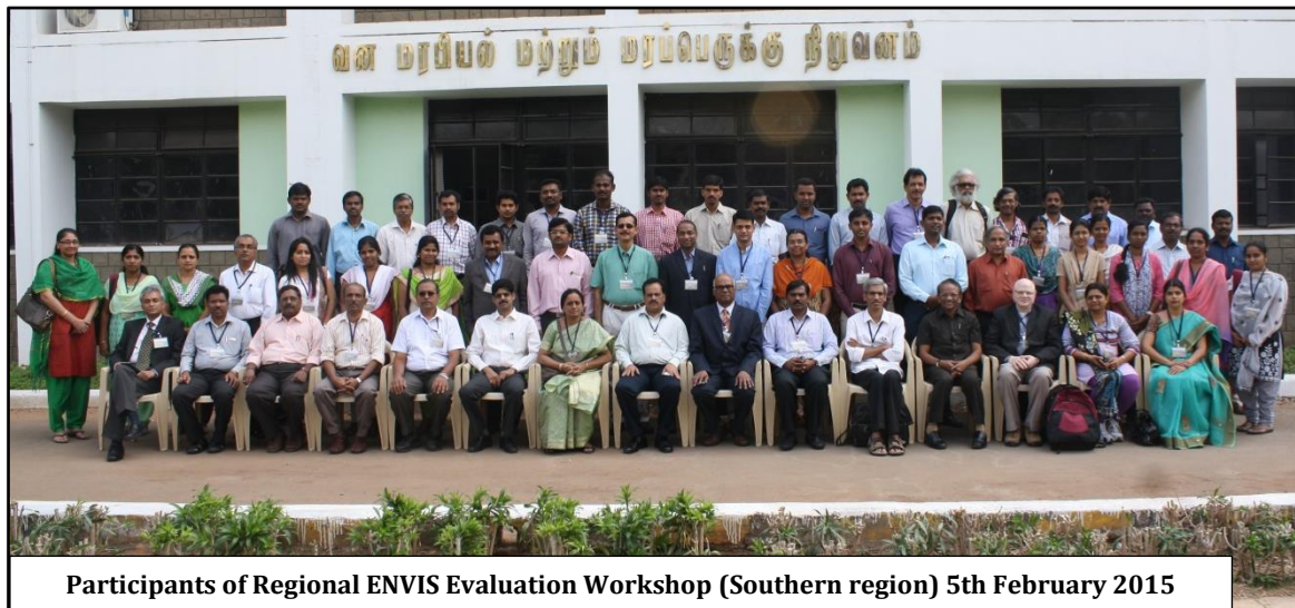
Participants of Regional ENVIS Evaluation Workshop (Southern region) 5th February 2015